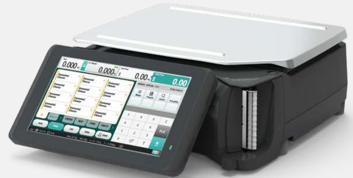
SM-5300 EV X

• Specifications are subject to change without prior notice • Meet or exceed OIML Class III requirements