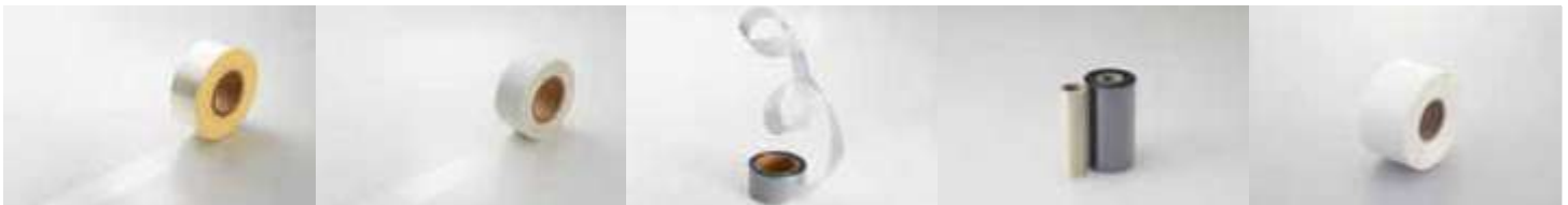
Clear RGW Band